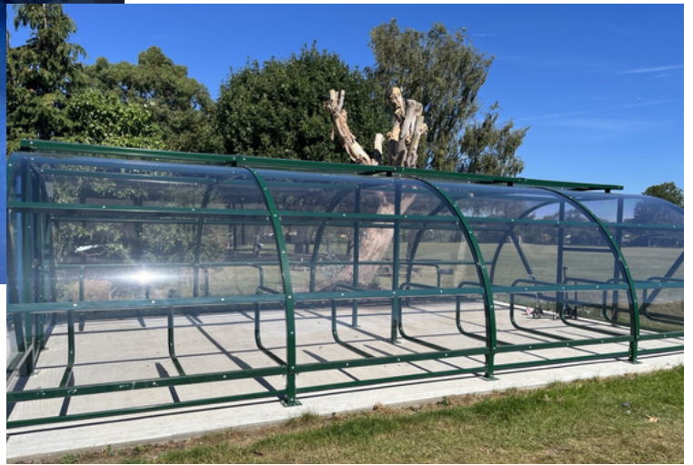
The new bike shed

And that brings us to the end of our first newsletter this year. It just remains for me to wish you a wonderful weekend filled with sun cream and ice-lollies and I leave you with this thought: